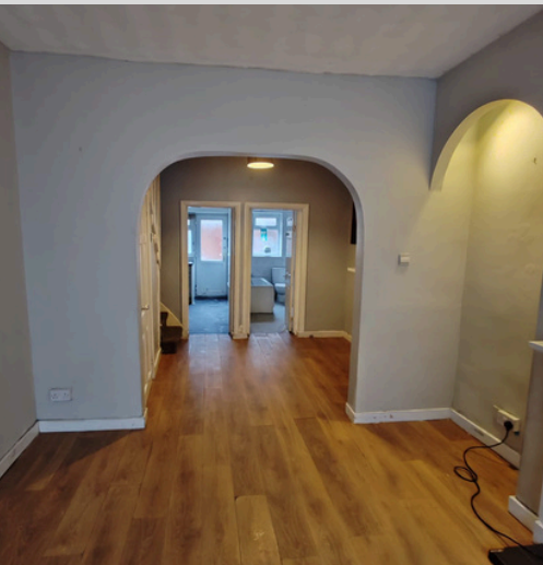
Open Plan Lounge